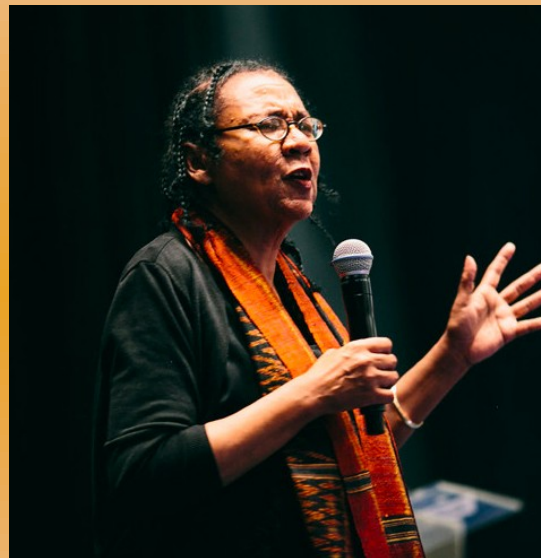
bell hooks, PhD Writer, professor, feminist theorist, activist