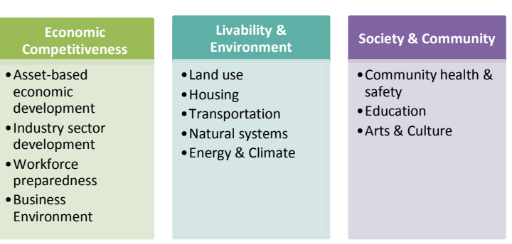
Figure 2: Planning Committees & Topics

challenges facing the region. The planning process will be divided into three phases designed to explore existing conditions and trends, consider different scenarios for future growth and development and develop a detailed action plan for achieving the region's vision and goals. Public outreach will play a key role in the development of the plan. Each phase will seek to answer specific questions through scenario planning exercises that gather input and explore priorities of residents throughout the region.