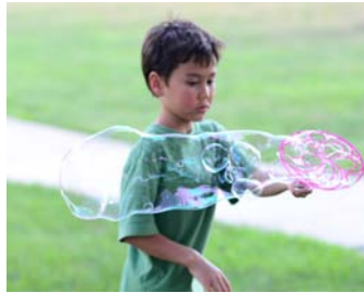
Playing with bubbles at the carnival