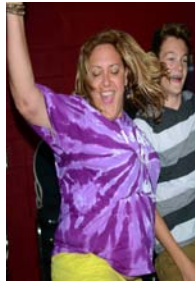
Dancing at Night Owls