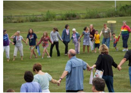
Connecting deeply within ourselves; connecting deeply with others