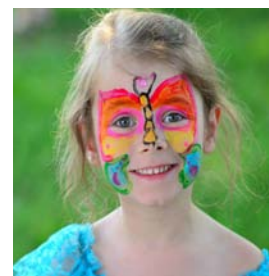
A young camper gets her face painted at the carnival