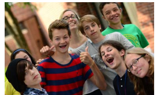
Teens and Young Adults smile for the camera